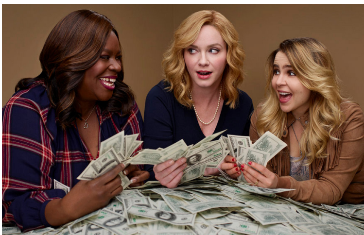
PICTURED ABOVE: Retta, Christina Hendricks and Mae Whitman star in NBC’s “Good Girls” now on Netflix

Find the full first season on Netflix and new episodes on NBC, Sundays at 10 p.m