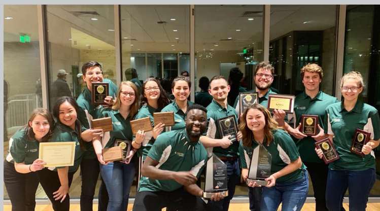
PICTURED ABOVE: Debate Team celebrates national runner-up win

Forensics, Speech & Debate still has three more