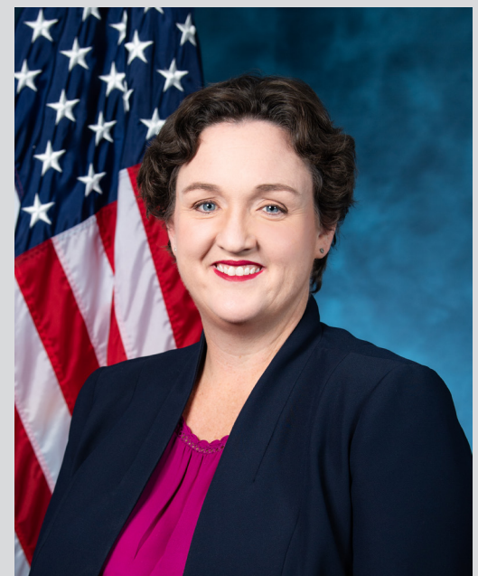
PICTURED ABOVE: Congresswoman Katie Porter will speak at a Town Hall meeting on Concordia's campus on April 25.