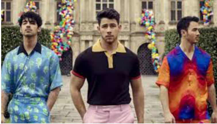
PICTURED ABOVE: Jonas Brothers are back together